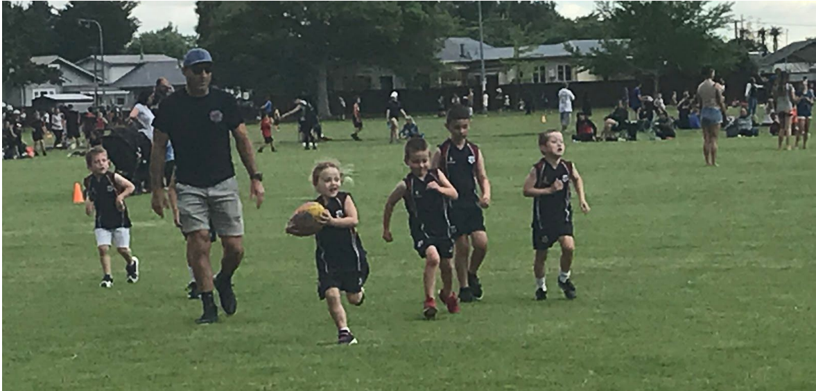
Our awesome little year 0-2 "Dashers" touch team.